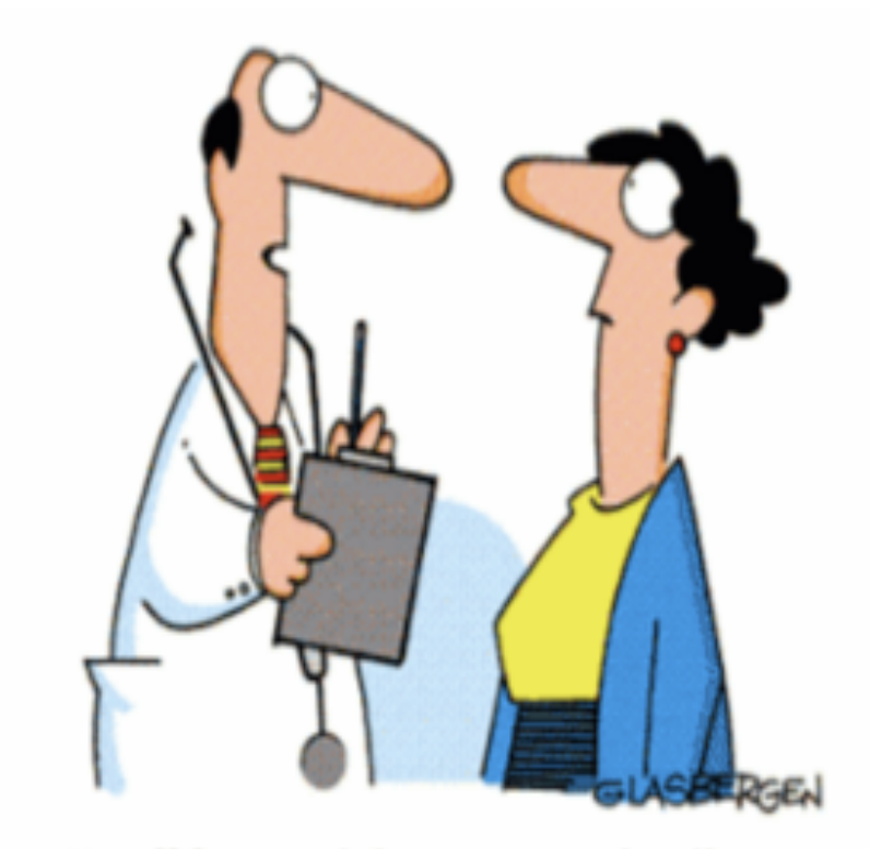
"You'll lose weight on any strict diet, but it's mostly water...from crying."